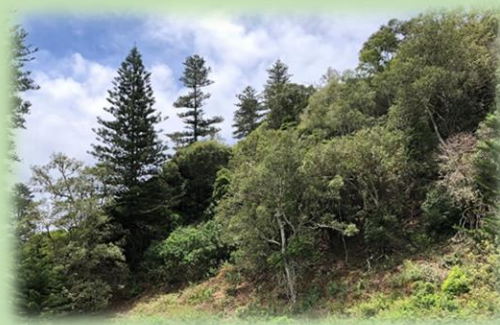
7. Sheltered Coastal Forest