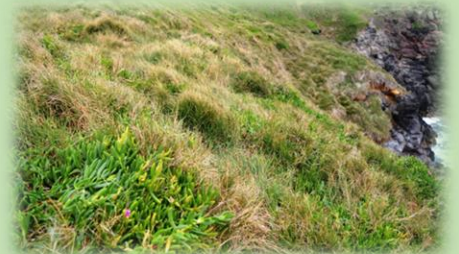
11. Coastal Grassland