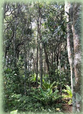
5. Plateau Hardwood Forest