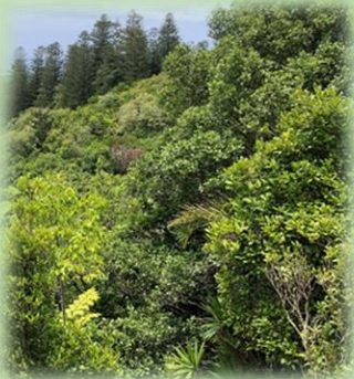
2. Moist Upland Hardwood Forest