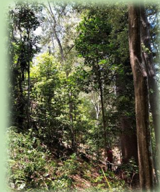
6. Lowland Valley Hardwood Forest