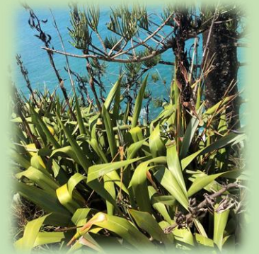
13. Coastal Flax Community