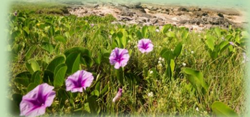
10. Sandy Beach Herbland