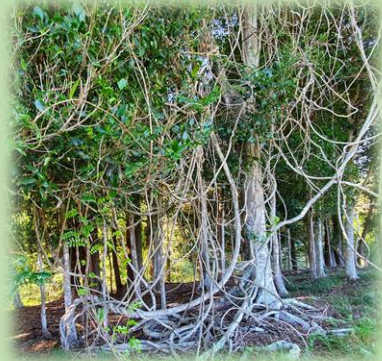
4. Viny Hardwood Forest