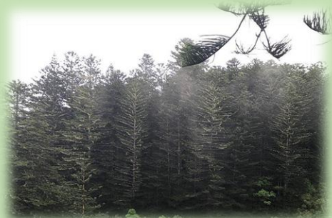
3. Pine Hardwood Ridge Forest