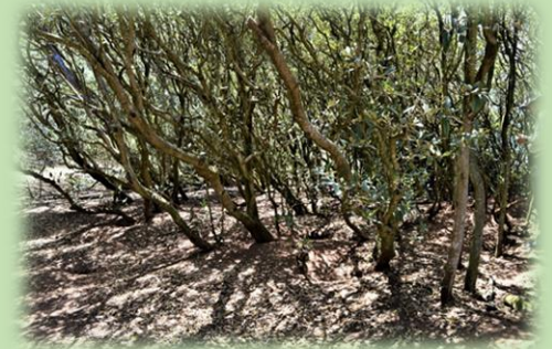
9. Coastal White Oak Shrubland