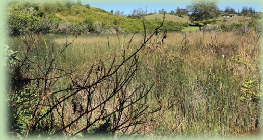
14. Freshwater Swamp