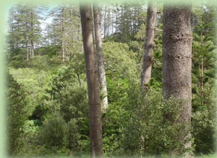
8. Coastal Pine and White Oak Forest